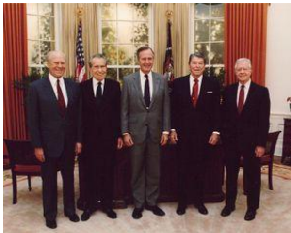
Presidents Ford (38), Nixon (37), Bush (41) Reagan (40), Carter (39)