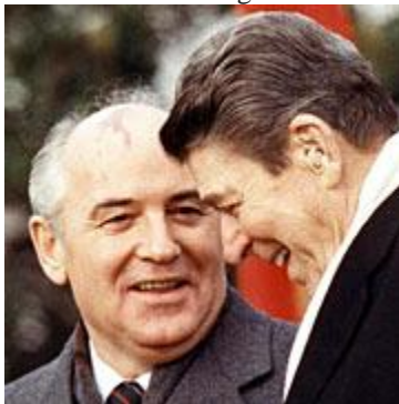
Gorbachev and Reagan

The arms control agreement was one indication that the Cold was ending. Within a few short years, the Soviet Union fell apart as reformers pressed for more gains. The changes in the Soviet Union echoed through out Easter Europe. In 1989, East German leaders announced that people could travel freely to West Germany and the Berlin wall came to an end. Reform movements continued throughout Poland, Czechoslovakia and the rest of the Eastern part of the Iron Curtain.