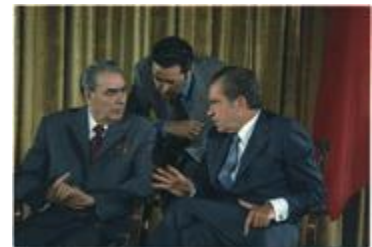
Nixon meets with Brezhnev during the Soviet Leader's trip to the U.S. in 1973