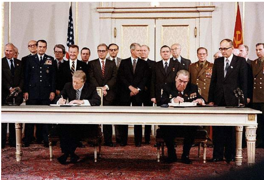
President Jimmy Carter and Soviet General Secretary Leonid Brezhnev sign the Strategic Arms Limitation Talks (SALT II) treaty, June 18, 1979, in Vienna

Finally Carter and Soviet president Leonid Brezhnev signed the new treaty in Vienna in June 1979. More complicated than SALT I, it limited the number of warheads and missiles each power retained. SALT II Still had to be ratified by the Senate, however. This ratification never happened because of the Soviet decision to invade neighboring Afghanistan.