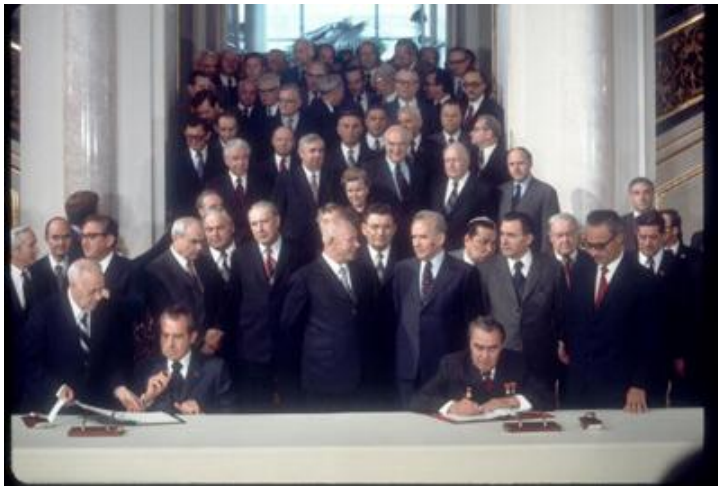
President Richard Nixon and Russian leader Leonid Brezhnev sign the SALT treaty, freezing certain U.S. and Soviet weapons systems, on May 26, 1972 in the Kremlin in Moscow, Russia.

SALT I was a diplomatic triumph and an important step forward. But it did little to limit the number of warheads the two nations possessed or to stop them from improving nuclear weapons systems in other ways.