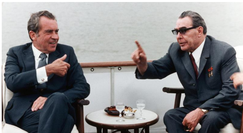
Nixon and Brezhnev