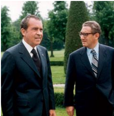
Richard Nixon and Henry Kissinger, 1972.

Nixon drew on Kissinger's understanding that foreign affairs were more complex than a simple standoff between the United States and the threat of communism. Kissinger pointed out that there were deep rifts in the communist world itself, "The deepest international conflict in the world today is not between us and the Soviet Union but between the Soviet Union and Communist China."